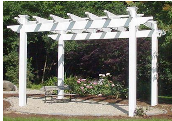
FREE STANDING PERGOLA